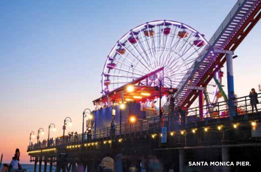
SANTA MONICA PIER.