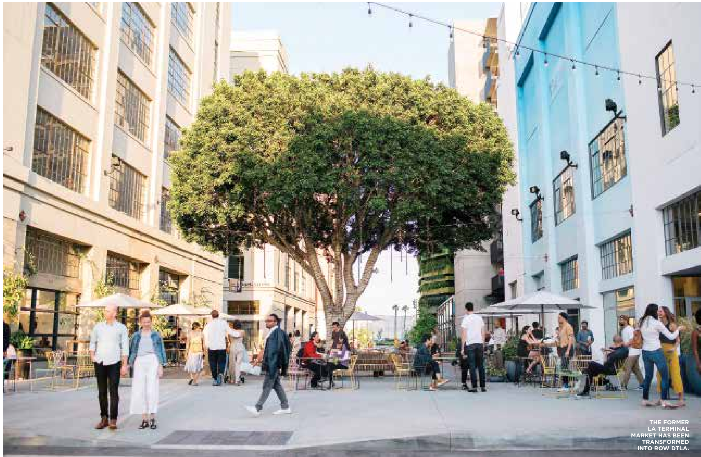
THE FORMER LA TERMINAL MARKET HAS BEEN TRANSFORMED INTO ROW DTLA.