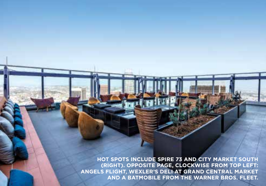
HOT SPOTS INCLUDE SPIRE 73 AND CITY MARKET SOUTH (RIGHT). OPPOSITE PAGE, CLOCKWISE FROM TOP LEFT: ANGELS FLIGHT, WEXLER'S DELI AT GRAND CENTRAL MARKET AND A BATMOBILE FROM THE WARNER BROS. FLEET.