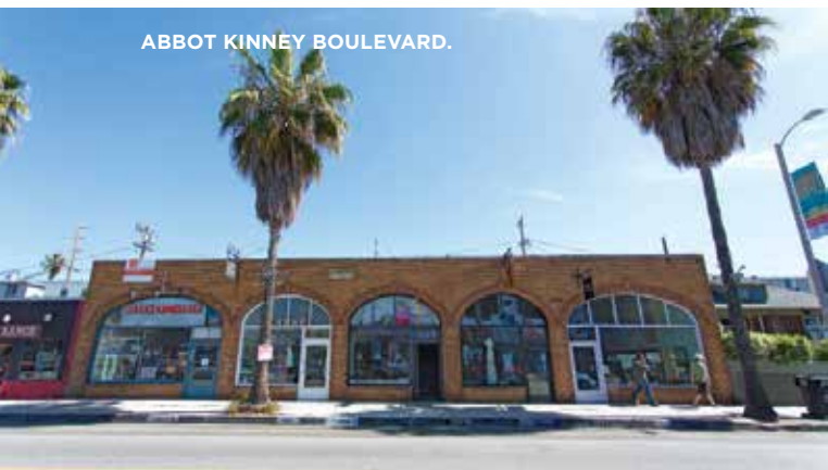
ABBOT KINNEY BOULEVARD.